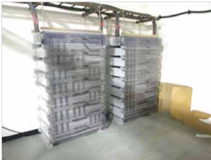
2,000 Amp DC Power Plant (Expandable)