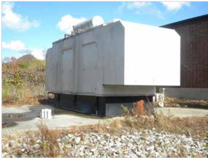
800 KW Backup Generator (Expandable)