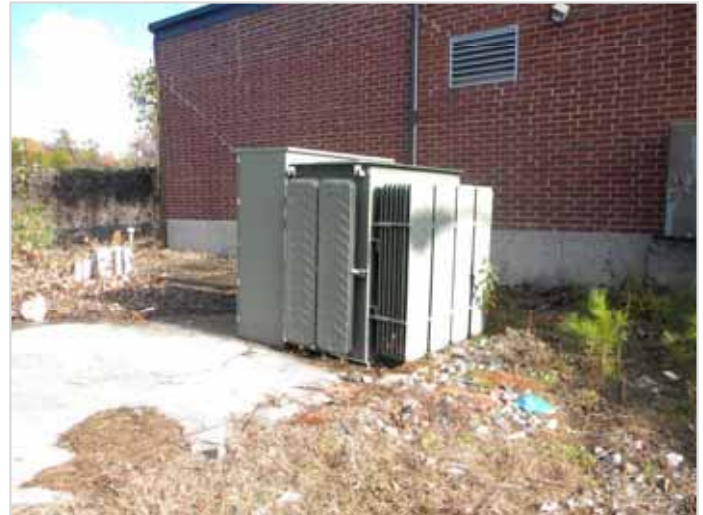
2,000 KVA Transformer (Expandable)