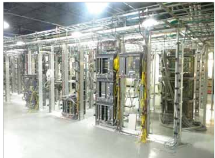
Existing Racking/Server Farm (Expandable)