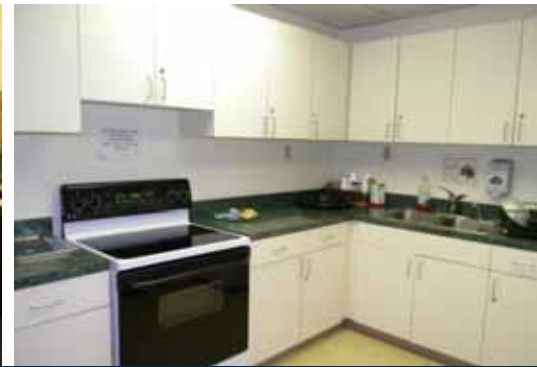
➤ Multiple common areas on each level including production stations, common workstations, and full and partial kitchens