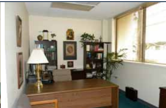
➤ The 680 West Peachtree St. property has many single offices and various employee workstations