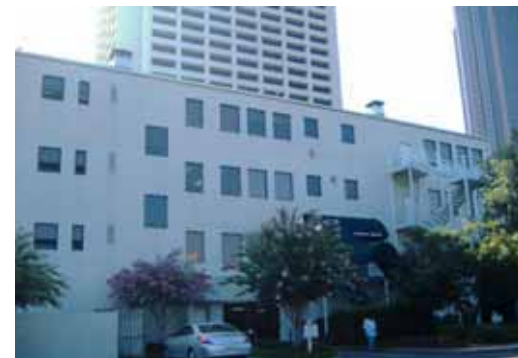
➤ Various points of entry around building