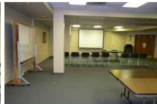
➤ Fully functioning conference rooms available on floors one, two & three