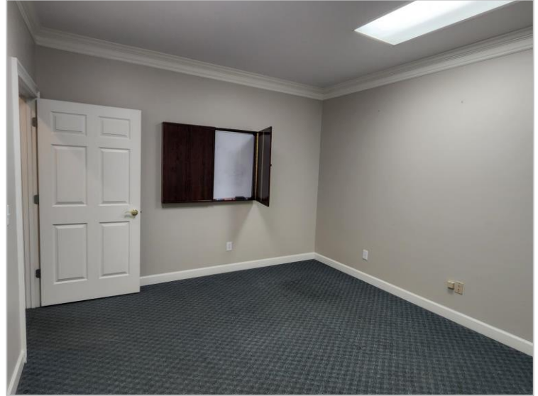
Executive Office or Conference Room