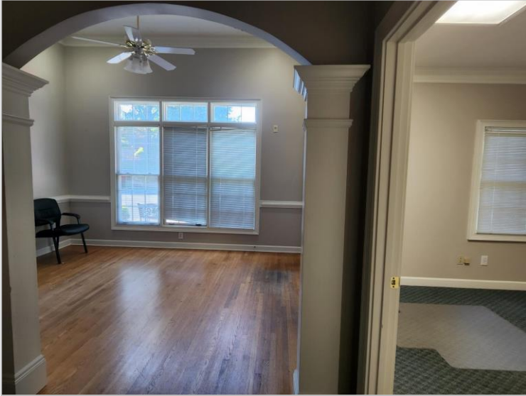
Upstairs Reception Area and Front Office

500 Sun Valley Drive BUILDING G, SUITE 300 Roswell, GA 30076