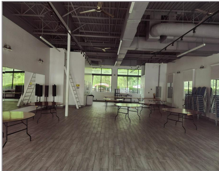
Interior Suite D-110