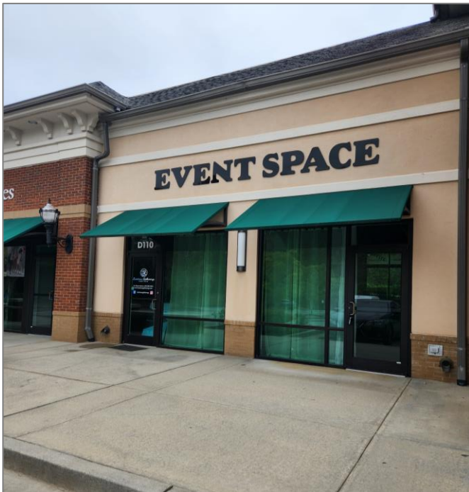
Exterior- Store Front, Suite D-110