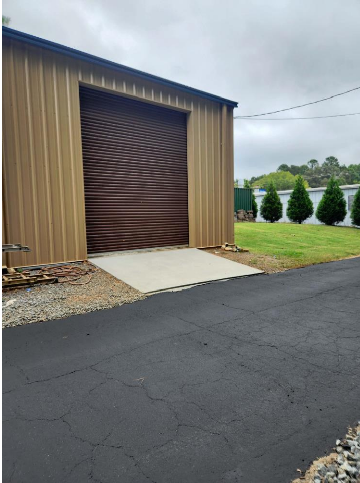
Building Rear, Drive-in Door