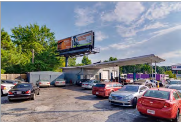
Main Building Front- Left, Container & Billboard