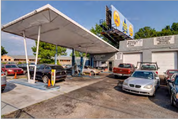
Main Building- Front & Canopy