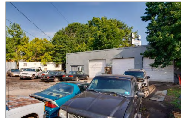
Building B- Front & Trailer