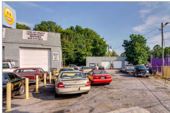
Main Building- Left; Building B- Front