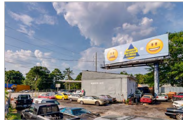
Main Building Side, Rear & Billboard