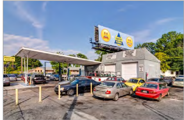
Main Building Front- Right