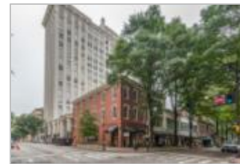
Healey Building Exterior at the Corner of Broad & Forsyth Street