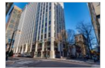
Healey Building Exterior along Walton Street