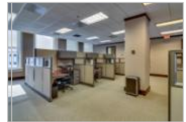
Work Station Area