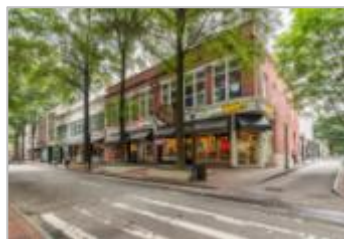
Shops & Eateries Along Broad Street