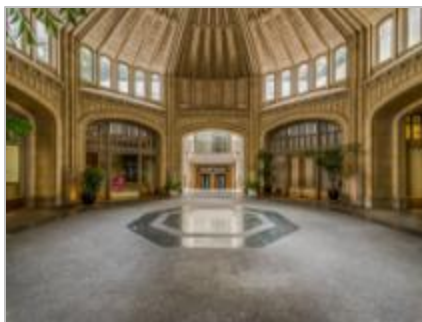
The Historic Healey Building Entrance