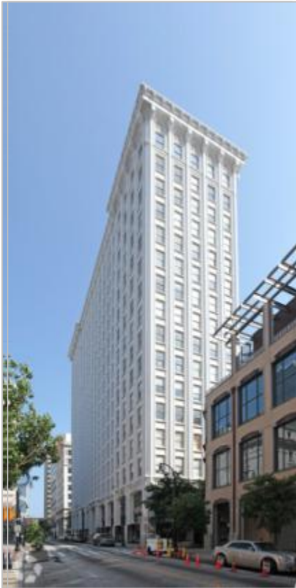
The Historic Healey Building