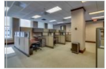
Work Station Area